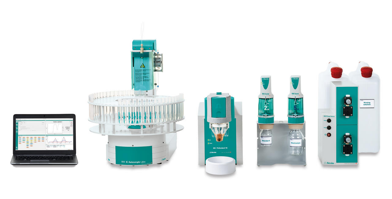
Figure 1. 884 Professional VA, fully automated for VA analysis

measuring vessel. The determination of zinc is carried out with the 884 Professional VA using the parameters specified in Table 1 . The concentration is determined by two additions of a zinc standard addition solution.