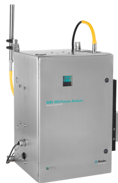
Figure 2. NIRS XDS Process Analyzer from Metrohm Process Analytics.

Wavelength range used: 1100–1650 nm. Inline analysis is possible using a micro interactance reflectance probe with purge on collection tip directly in the fluid bed dryer.