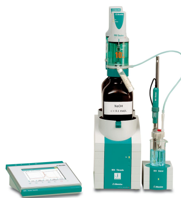
Figure 1. Example of a Titrand system consisting of a 905 Titrand and a 900 Touch Control. Alternatively the 905 Titrand can also be connected to a PC and controlled by tiamo.

The prepared sample is titrated potentiometrically against standardized sulfuric acid until after the first equivalence point.