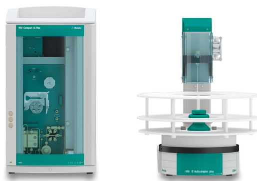
Figure 1. Instrumental setup including a 930 Compact IC Flex with IC Conductivity Detector and a 919 IC Autosampler plus.

The samples were injected directly into the ion chromatograph (Figure 1) without further sample preparation and analyzed using the method parameters given in the USP monograph (Table 1). Anionic components were separated isocratically on a Metrosep A Supp 1 - 250/4.0 column containing the alternative packing material L46. The conductivity signal was detected after sequential suppression.