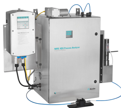
Figure 3. The NIRS XDS Process Analyzer – MicroBundle from Metrohm Process Analytics.