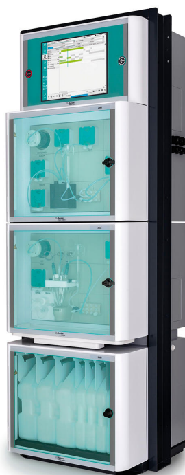
Figure 2. 2060 TI Process Analyzer from Metrohm Process Analytics.

hydrosulfite, but also pH and conductivity measurements to give an overall health status of the dye baths without delay.