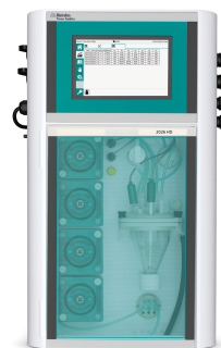
Figure 4. The 2026 HD Titrolyzer from Metrohm Process Analytics can monitor up to two critical parameters online in the anodizing process.

Aluminum is also an ideal material for other surface treatment applications. It can be cleaned using acid pickling processes to ensure complete passivation. A pickling process is also used to prepare the aluminum for applying a conversion coating as a protective surface layer.