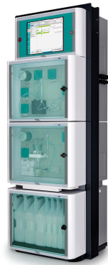
Figure 3. The 2060 TI Process Analyzer from Metrohm Process Analytics can monitor several critical parameters online in the anodizing process.

within the bath, such as dissolved aluminum, sodium hydroxide, and sulfuric acid (free acid). This near real-time data allows for immediate adjustments to be made, ensuring the bath chemistry remains within the designated range 24/7. The elimination of manual sampling combined with the continuous monitoring offered by online analyzers significantly reduces the risk of bath chemistry fluctuations, ultimately leading to fewer defects and the need for rework. By providing a constant flow of accurate data, online process analyzers empower manufacturers to achieve consistent, high-quality anodizing results.