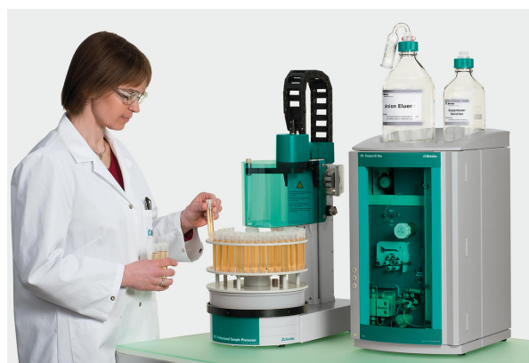
Figure 1. Compact, user-friendly Metrohm IC instrumentation to quantify oxyhalides besides standard anions in drinking water.

DCA is the acetate form of DCAA (dichloroacetic acid) and can be present in treated drinking waters, but also in groundwater or swimming pools as a reaction product from organic material during the chlorination process [3, 8]. The provisional WHO guideline for DCA in drinking water is 0.05 mg/L because it exhibits potential health hazards [1]. Therefore, it must be separated from the other ions to guarantee appropriate resolution and quantification.