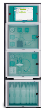
Figure 2. 2060 Process Analyzer.

In order to extract the proper compounds, keep the pH within specifications, and brew the same flavors over multiple batches, both alkalinity and hardness of the process and make-up water must be monitored and kept at proper levels. The Metrohm Process Analytics 2060 and 2035 Process Analyzers ( Figures 2 and 3 ) are ideally suited for the fully automatic execution of these important analyses, as well as additional parameters like pH or conductivity. The process analyzer can send an alarm to the plant control system if alkalinity or hardness levels are not optimal, signaling the distribution control to correct the water chemistry, ensuring consistent product quality.