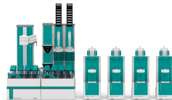
Figure 1. The OMNIS Sample Robot S equipped with an OMNIS Professional Titrator, plus a corresponding amount of OMNIS Dosing Modules to add all necessary solutions, and dPt Titrode for the automated determination of iodine value.

An appropriate amount of sample is weighed into the titration beaker, then the beaker is covered with a lid and placed on the sample rack. Before the titration, glacial acetic acid, Wijs solution (ICl), and magnesium acetate solution are added, and the solution is stirred for five minutes. Afterwards, potassium iodide solution is added, and the solution is titrated with standardized sodium thiosulfate until after the equivalence point.