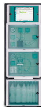
Figure 2. 2060 Process Analyzer.

In order to extract the proper compounds, keep the pH within specifications, and brew the same flavors over multiple batches, both alkalinity and hardness of the process and make-up water must be monitored and kept at proper levels. The Metrohm Process Analytics 2060 and 2035 Process Analyzers ( Figures 2 and 3 ) are ideally suited for the fully automatic execution of these important analyses, as well as additional parameters like pH or conductivity. The process analyzer can send an alarm to the plant control system if alkalinity or hardness levels are not optimal, signaling the distribution control to correct the water chemistry, ensuring consistent product quality.