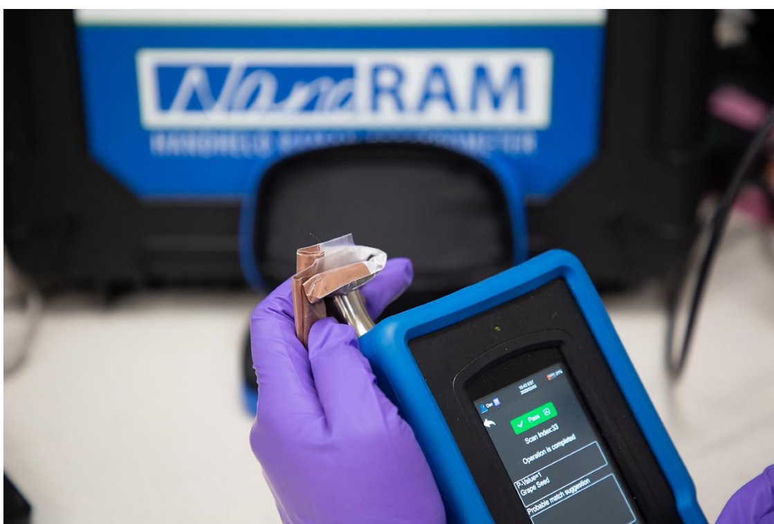
Figure 2. Analyzing grape seed extract with 1064 nm laser with point and shoot adapter.

darker colored samples. For this case study the NanoRam-1064 Identification mode was utilized because it provides a robust algorithm based on a multivariate method. For each botanical sample an individual method was created. To create a method each sample was scanned five different times in alternate spots. All samples were tested against each method to prove validity.