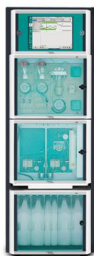
Figure 3. The 2060 IC Process Analyzer is available with either one or two measurement channels, along with integrated liquid handling modules and several automated sample preparation options.