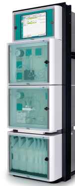
Figure 2. 2060 Process Analyzer for photometric measurements of ultratrace iron and copper in the water-steam circuit of power plants.

The metal transportation in power plant water circuits is currently monitored by CPS racks which collect particulate metals on filter pads over a period of one day to a week. The pads are later digested, and the metals analyzed by ICP-OES or ICP-MS. Total analysis time can take from one to three weeks. Monitoring only the accumulated corrosion products causes a loss of transportation peaks, and detailed information on why the metal loss occurred is lost. A maximum of 2 µg/L Fe is recommended by the Electric Power Research Institute (EPRI) in order to avoid FAC-related issues in the water-steam circuit, and these levels are not accurately measured with the current CPS racks, as seen in long-term comparisons. The continuous online ultratrace analysis of Fe and Cu in the water-steam circuit of power plants is possible using the 2060 Process Analyzer (Figure 2) from Metrohm Process Analytics. This automated process analysis system enables early detection of corrosion processes and peaks, and also monitors the formation and destruction of the protective oxide layer (Figure 3). Continuous analyses also signal a problem before dissolved metals can reach the condensate stream and thus the turbine blades where they would cause damage. In combination with the power plant's Distributed Control System (DCS), online monitoring of Fe and Cu ensures that corrosion can be controlled before it affects the power plant efficiency, ultimately decreasing downtime and lowering maintenance costs.