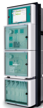
Figure 2. 2060 Process Analyzer for photometric measurements of ultratrace iron and copper in the water-steam circuit of power plants.

The metal transportation in power plant water circuits is currently monitored by CPS racks which collect particulate metals on filter pads over a period of one day to a week. The pads are later digested, and the metals analyzed by ICP-OES or ICP-MS. Total analysis time can take from one to three weeks. Monitoring only the accumulated corrosion products causes a loss of transportation peaks, and detailed information on why the metal loss occurred is lost. A maximum of 2 µg/L Fe is recommended by the Electric Power Research Institute (EPRI) in order to avoid FAC-related issues in the water-steam circuit, and these levels are not accurately measured with the current CPS racks, as seen in long-term comparisons. The continuous online ultratrace analysis of Fe and Cu in the water-steam circuit of power plants is possible using the 2060 Process Analyzer (Figure 2) from Metrohm Process Analytics. This automated process analysis system enables early detection of corrosion processes and peaks, and also monitors the formation and destruction of the protective oxide layer (Figure 3). Continuous analyses also signal a problem before dissolved metals can reach the condensate stream and thus the turbine blades where they would cause damage. In combination with the power plant's Distributed Control System (DCS), online monitoring of Fe and Cu ensures that corrosion can be controlled before it affects the power plant efficiency, ultimately decreasing downtime and lowering maintenance costs.