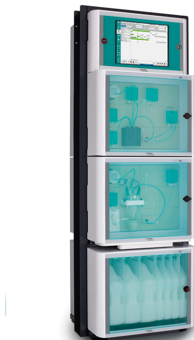
Figure 2. 2060 TI Process Analyzer for the online analysis of critical quality parameters in pickling baths using the method of titration.

over a wide concentration range—the 2060 TI Process Analyzer (Figure 2).