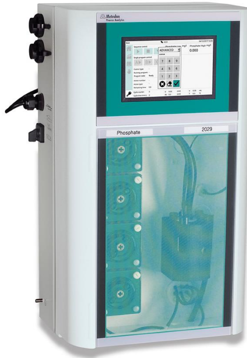
Figure 2. 2029 Process Photometer.