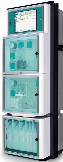
Figure 3. 2060 TI Process Analyzer.