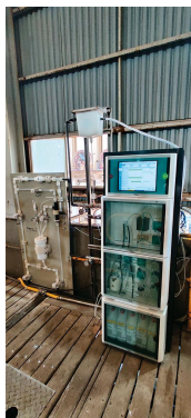
Figure 2. 2060 TI Process Analyzer with preconditioning panel in a zinc refining plant.

( Figure 2 ). Other combinations of measurements (e.g., pH), as well as measurement points taken from multiple streams, can be realized with this process analyzer.