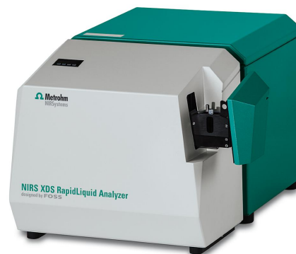
Figure 1. The NIRS XDS RapidLiquid Analyzer with a 1 mm quartz cuvette, used to collect the spectra of surfactant samples.

A total of 37 samples with varying surfactant content were provided by a customer. The Vis-NIR spectra (Figure 2) were acquired on a Metrohm NIRS XDS RapidLiquid Analyzer equipped with 1 mm quartz cuvette (Figure 1). The samples were measured as-is, without any sample preparation steps. Data collection and model development was carried out with the Vision Air complete software package.