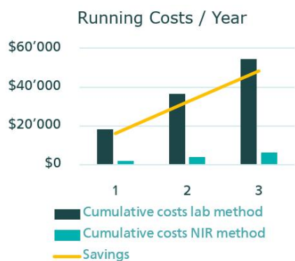
Figure 4. Comparison of the cumulative costs over three years for the determination of the hydroxyl number with titration and NIR spectroscopy.