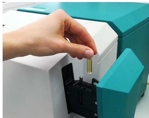
Figure 1. XDS RapidLiquid Analyzer and a polyol sample present in a 4 mm disposable vial.

Polyol samples were measured with the XDS RapidLiquid Analyzer in transmission mode over the full wavelength range (400–2500 nm). Reproducible spectrum acquisition was achieved using the built-in temperature control (at 30 °C) of the XDS RapidLiquid Analyzer. For convenience, disposable vials with a path length of 4 mm were used, which made cleaning of the sample vessels unnecessary. The Metrohm software package Vision Air Complete was used for all data acquisition and prediction model development.