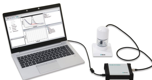
Figure 1. 946 Portable VA Analyzer (scTRACE Gold)

The scTRACE Gold is electrochemically activated prior to the first determination. In the next step, the water sample and the supporting electrolyte are pipetted into the measuring vessel. The determination of tellurium(IV) is carried out with the 884 Professional VA or with the 946 Portable VA Analyzer using the parameters specified in Table 1 . The concentration is determined by two additions of a tellurium(IV) standard addition solution.