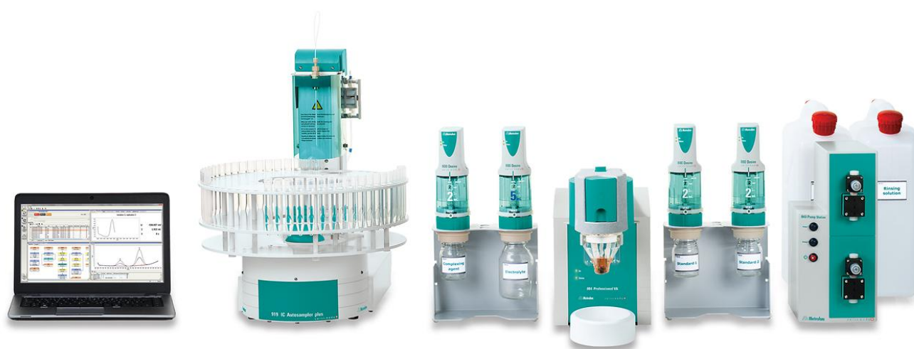
Figure 2. 884 Professional VA fully automated for VA