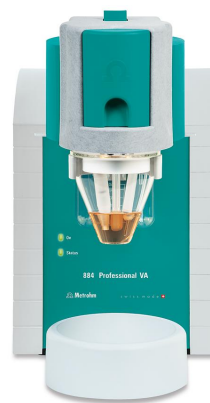
Figure 1. 884 Professional VA manual for MME.

Add the water sample to a vessel filled with degassed electrolyte. Use two standard additions with separate Fe(II) and Fe(III) standard solutions to perform the quantification.