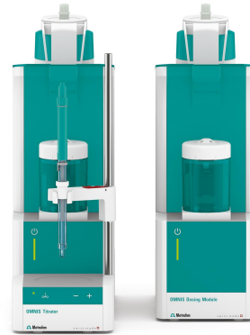
Figure 1. OMNIS titrator with the digital pH electrode and a dosing module.

Aliquots of the blank and sample were titrated against hydrochloric acid solution until after the last equivalence point (Figure 2).