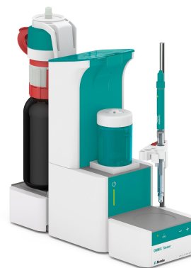
Figure 1. OMNIS Basic Titrator. Example setup for the determination of the pH value.

An aliquot of sample is pipetted into the sample beaker. While stirring, deionized water is added. After stirring for 1 minute, the pH value is measured until a stable drift is reached. Afterwards, the sensors are rinsed with deionized water for cleaning. The Profitrode is then conditioned for 2 minutes by immersing the glass membrane alone in deionized water.