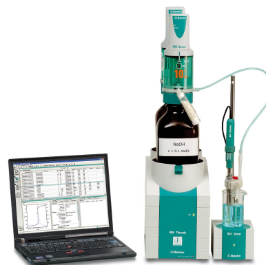
Figure 1. 905 Titrando with tiamo. Example setup for the analysis of lithium in brine.

Calcium will interfere with the analysis and has to be analyzed separately.