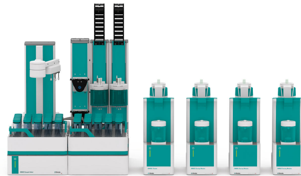
Figure 2. Sample Robot S with Dis-cover, OMNIS Dosing Modules and OMNIS Titrator Professional equipped with two dSolvotrodes.

on both work stations in parallel, acceptable results with low standard deviations are obtained. Results are summarized in Table 1 . An example titration curve is displayed in Figure 2 .