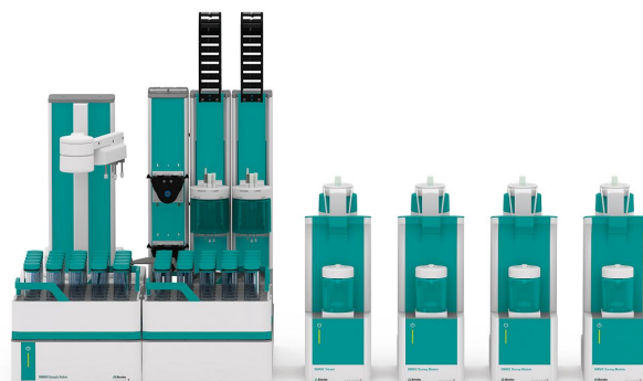
Figure 2. Sample Robot S with Dis-cover, OMNIS Dosing Modules and OMNIS Titrator Professional equipped with two dSolvotrodes.

An appropriate amount of sample is weighed into the titration beaker, acetonitrile is added, and the beaker is capped with the Dis-Cover lid. After dissolution of the sample, TSI solution is added, the beaker is covered and solution is stirred for the stipulated time. Then deionized water is added, and after stirring shortly, acetonitrile is added. The solution is titrated until after the second equivalence point with standardized tetrabutylammonium hydroxide in isopropanol.