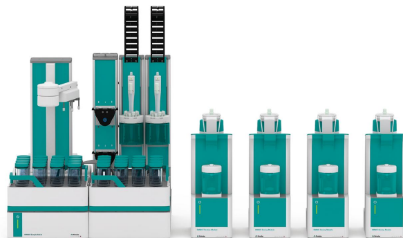
Figure 1. Example of an OMNIS system consisting of an OMNIS Sample Robot S with two working stations, an OMNIS Professional Titrator, and a corresponding amount of OMNIS Dosing Modules to add all necessary solutions.

An appropriate amount of sample is weighed into the titration beaker, then the beaker is covered with a lid and placed on the sample rack. Before the titration, glacial acetic acid, Wijs solution (ICl), and magnesium acetate solution are added and the solution is stirred for 5 minutes. Afterwards, potassium iodide solution is added and the solution is titrated with standardized sodium thiosulfate until after the equivalence point.