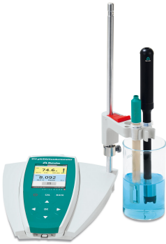
Figure 1. 914 pH/DO/Conductometer equipped with an O 2 -Lumitrode for the determination of dissolved oxygen in juices.

This analysis is carried out on a 914 pH/DO/Conductometer equipped with an O 2 -Lumitrode which is calibrated with 100% and 0% air saturation. The prepared sample is carefully opened and the O 2 -Lumitrode is placed directly into the sample. The measurement is started, and the DO content is measured until a stable value is reached. Afterwards, the sensor is removed and rinsed well with deionized water. If necessary, blot dry. For each analysis, a new sample bottle is opened. The sensor is stored dry with mounted calibration vessel for protection.