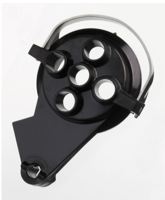
Titration vessel lid with 5 openings