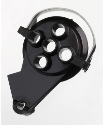
Titration vessel lid with 5 openings