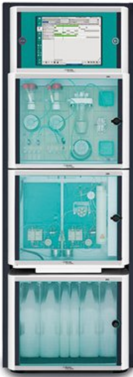
Figure 3. The 2060 IC Process Analyzer is available with either one or two measurement channels, along with integrated liquid handling modules and several automated sample preparation options.