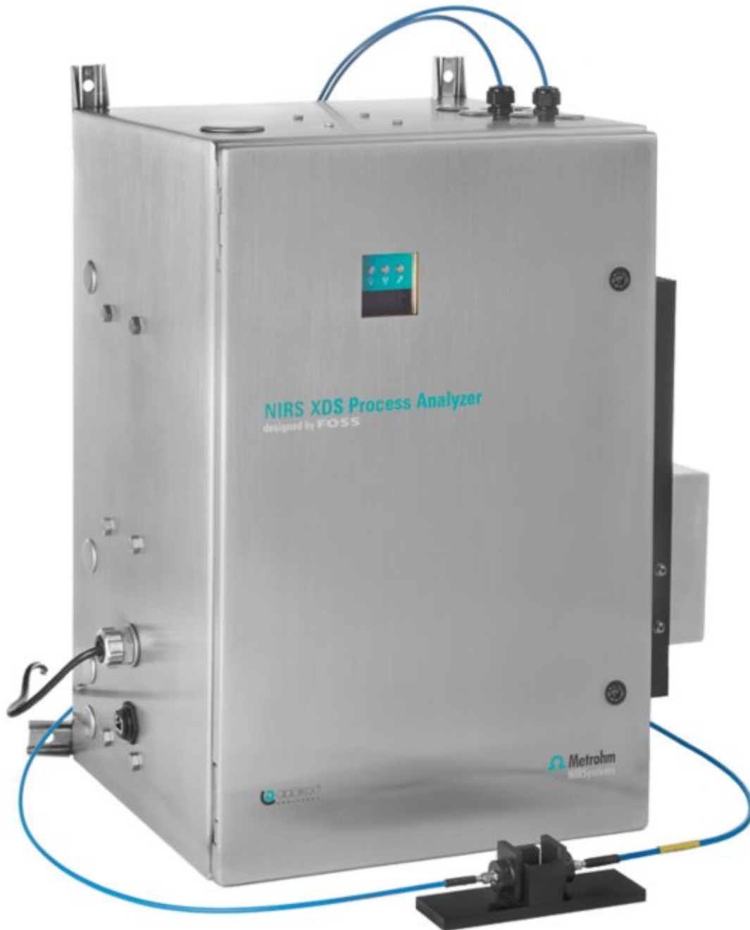
Figure 3. NIRS XDS Process Analyzer.

processing unit/tool itself. The distance between the instrument and the sample points (up to 9 possible with the multiplexer option) can be hundreds of meters apart and simply interfaced to the instrument with lowdispersion optical fibers. All process baths have a circulation loop made of PFA tubing. The flow cell, designed and customized by Metrohm Process Analytics, can be clamped on to these tubes for easy installation, with no need to modify the existing setup. Just clamp the flow cell on, and start measuring.