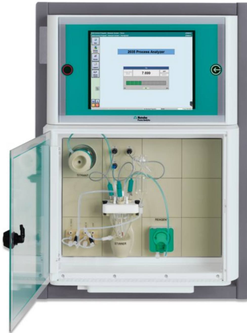
Figure 3. 2035 Process Analyzer - Potentiometric for accurate determination of TMAH in developer.

The 2035 Process Analyzer configured for potentiometric titration performs the accurate analysis of TMAH online using a combined pH electrode. Precise dosing of TMAH in the developer solution by the analyzer is also a possibility to ensure a stable concentration for every batch.