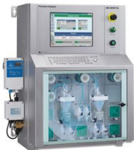
Figure 2. ADI 2045TI Ex proof (ATEX) Analyzer.

Chloride is analyzed with conductivity detection as described in ASTM D3230 with the ADI 2045TI Ex proof Analyzer ( Figure 2 ).