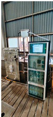
Figure 2. 2060 TI Process Analyzer with preconditioning panel in a zinc refining plant.

( Figure 2 ). Other combinations of measurements (e.g., pH), as well as measurement points taken from multiple streams, can be realized with this process analyzer.