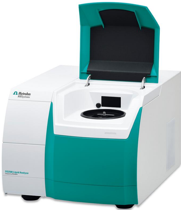
Figure 1. Metrohm DS2500 Liquid Analyzer used for the determination of research octane number (RON) in isomerate samples.