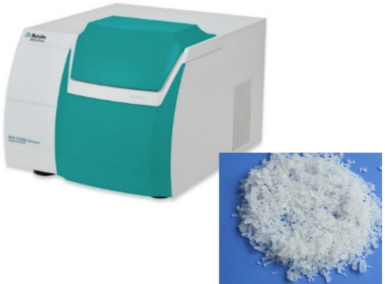
Figure 1. The DS2500 Solid Analyzer was used to collect the spectra of PVA polymer.

54 spectra from 18 different sample batches were collected using a Metrohm DS2500 Solid Analyzer in combination with the Vision Air Complete spectroscopy software. To overcome