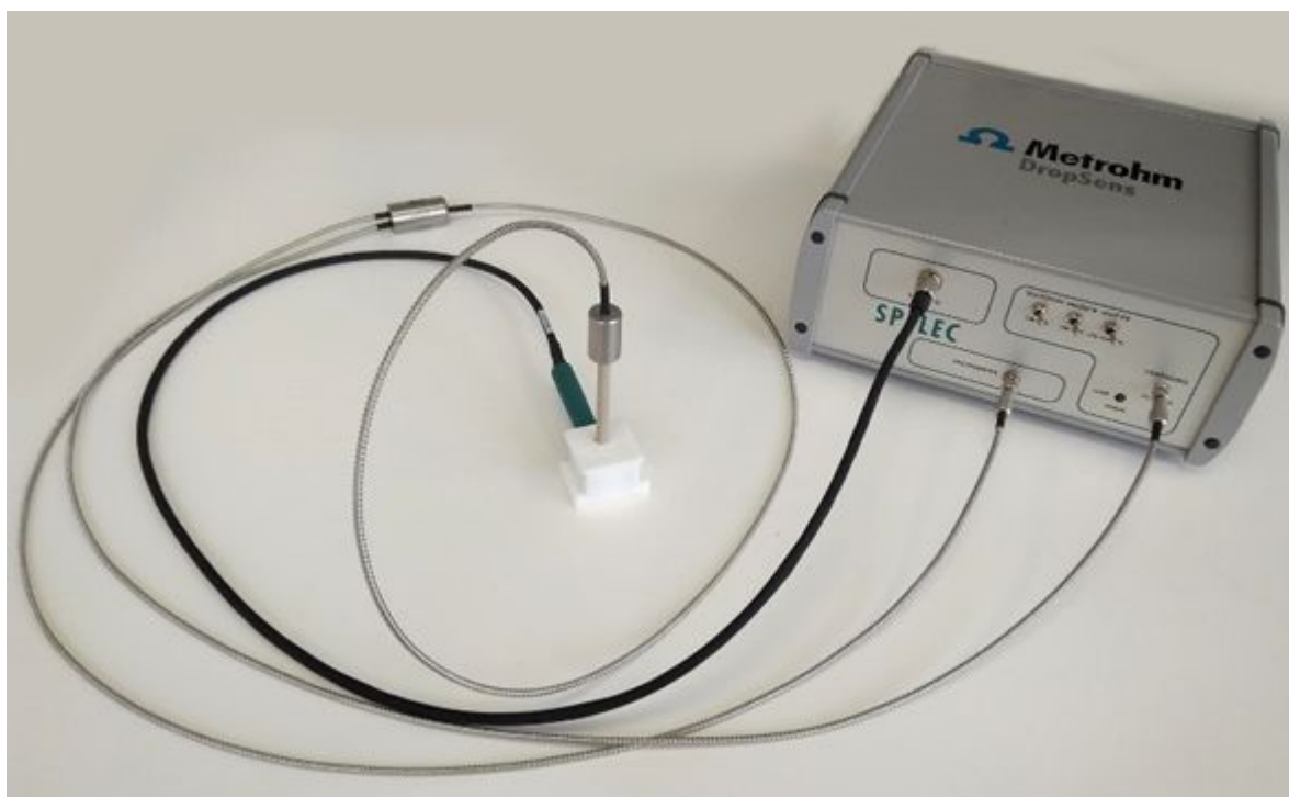
Figure 1. Setup for UV/VIS spectroelectrochemistry.

Spectroelectrochemical monitoring was performed using SPELEC, a fully-integrated instrument for UV/VIS spectroelectrochemistry. This instrument integrates in a unique box the electrochemical (bipotentiostat/galvanostat) and the spectroscopic equipment (light source and detector). SPELEC was used in combination with a bifurcated reflection probe (RPROBE-VIS-UV) ( Figure 1 ). This instrument is controlled by Dropview SPELEC, a dedicated software that allows performing real-time spectroelectrochemical measurements and provides completely synchronized electrochemical and optical data.