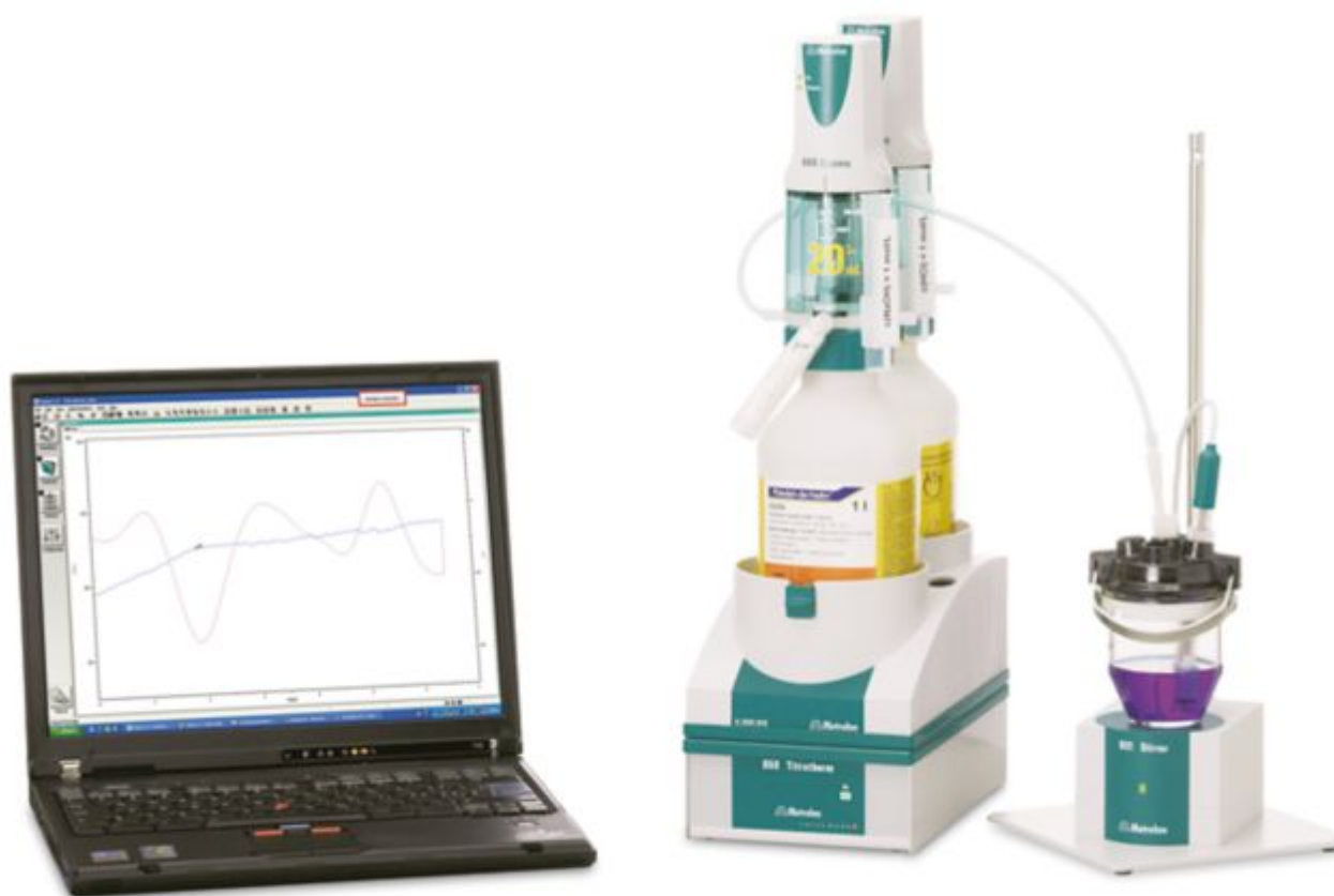
Figure 1. 859 Titrotherm setup for the thermometric titration and the data evaluation performed with tiamo.

The analysis is carried out with an 859 Titrotherm equipped with a Thermoprobe. The titration is based on the precipitation of potassium with sodium tetrphenylboron (STPB).