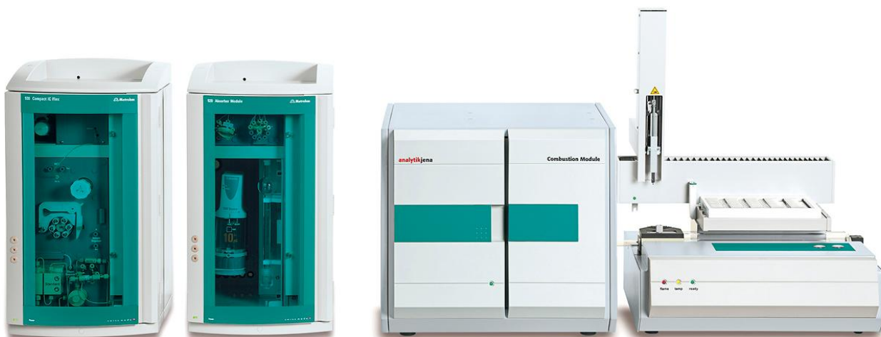
Figure 1. Combustion IC setup consisting of a 930 Compact IC flex (2.930.2560), a 920 Absorber Module (2.920.0010), a Combustion Module (Oven + ABD, 2.136.0700), and a MMS 5000 Autosampler (2.136.0800) configured for solid samples (6.7302.000).

an autosampler for solid samples, a combustion module, an absorber module, and an ion chromatograph (IC) (Figure 1).