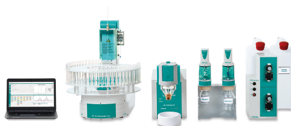
Figure 1. 884 Professional VA fully automated for VA.

Add water, the Ni plating bath sample, and the supporting electrolyte into the measuring vessel. The determination of lead is carried out with the 884 Professional VA (Figure 1) using the parameters specified in Table 1. The concentration is determined by two additions of lead standard addition solution. Activate the Bi drop electrode electrochemically prior to the first determination.