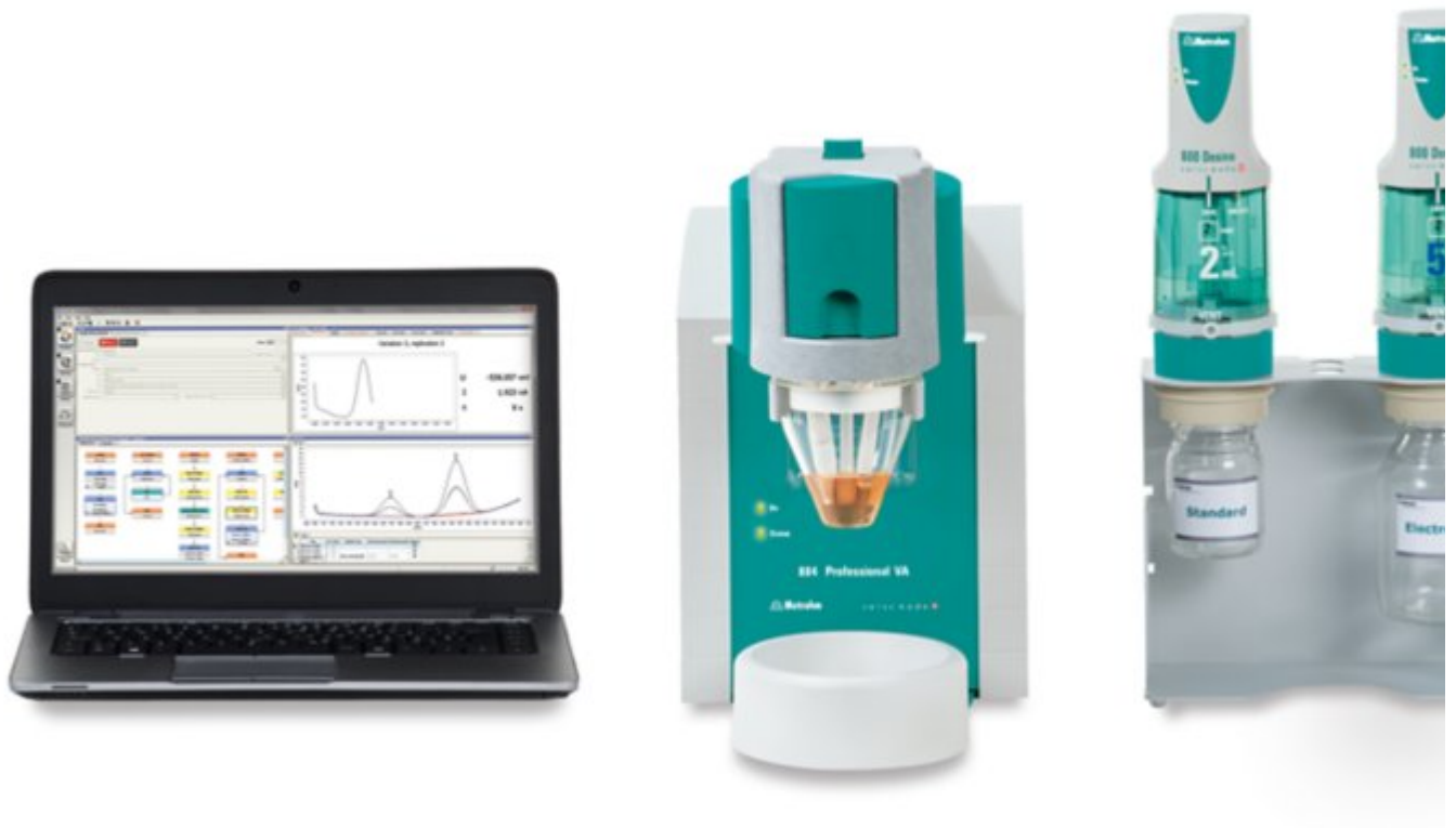
Figure 2. 884 Professional VA, semiautomated for VA analysis

The determination of tellurium(IV) is carried out with the 884 Professional VA or with the 946 Portable VA Analyzer using the parameters specified in Table 1 . The concentration is determined by two additions of a tellurium(IV) standard addition solution.