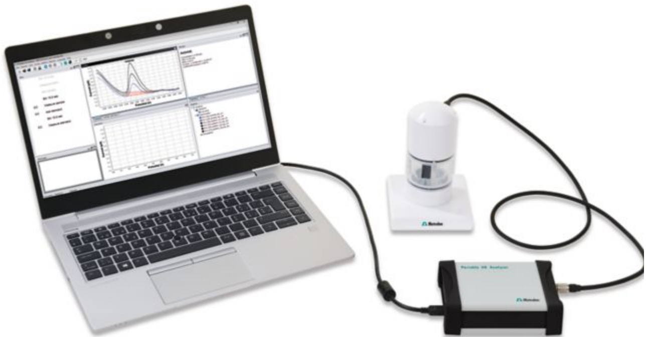
Figure 1. 946 Portable VA Analyzer (scTRACE Gold)

The scTRACE Gold is electrochemically activated prior to the first determination. In the next step, the water sample and the supporting electrolyte are pipetted into the measuring vessel.