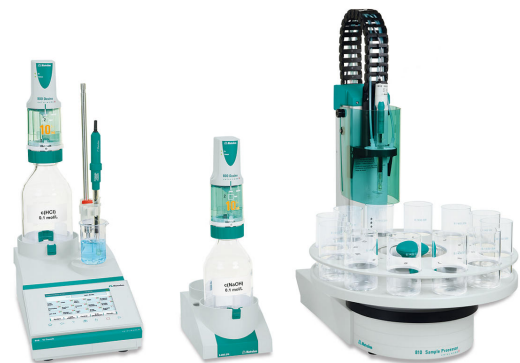
Figure 1. 916 Ti-Touch and 810 Sample Processor. Example setup for the determination of the permanganate index in water.

To stabilize the sample, sulfuric acid is added directly after sampling.