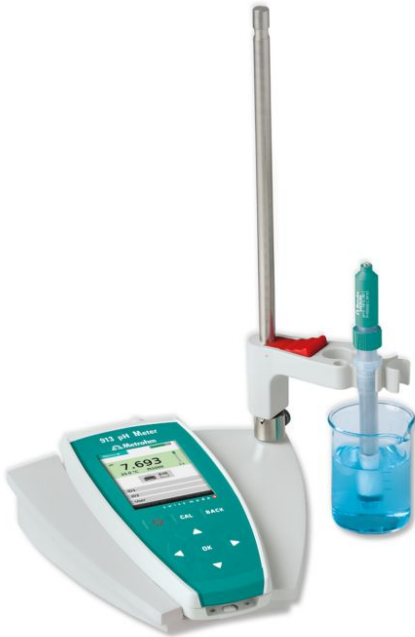
Figure 1. 913 pH Meter equipped with a pH electrode. Example setup for the determination of the pHe value.

This application is performed on a 913 pH Meter equipped with an EtOH Trode, a temperature sensor, and an external stirring plate. The EtOH Trode is conditioned and calibrated prior to use.