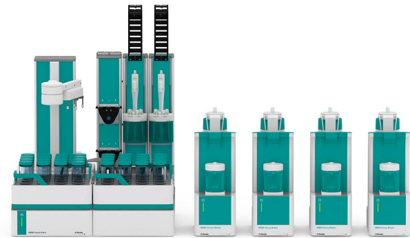
Figure 1. Example of an OMNIS system consisting of an OMNIS Sample Robot S with two working stations, an OMNIS Professional Titrator, and a corresponding amount of OMNIS Dosing Modules to add all necessary solutions.

The analysis is carried out automatically on an OMNIS system consisting of an OMNIS Sample Robot S and an OMNIS Titrator. The maintenance-free dPt Titrode is used for indication of the equivalence point. An appropriate amount of sample is weighed into the titration beaker, then the beaker is covered with a lid and placed on the sample rack. Before the titration, glacial acetic acid, Wijs solution (ICl), and magnesium acetate solution are added and the solution is stirred for 5 minutes. Afterwards, potassium iodide solution is added and the solution is titrated with standardized sodium thiosulfate until after the equivalence point.