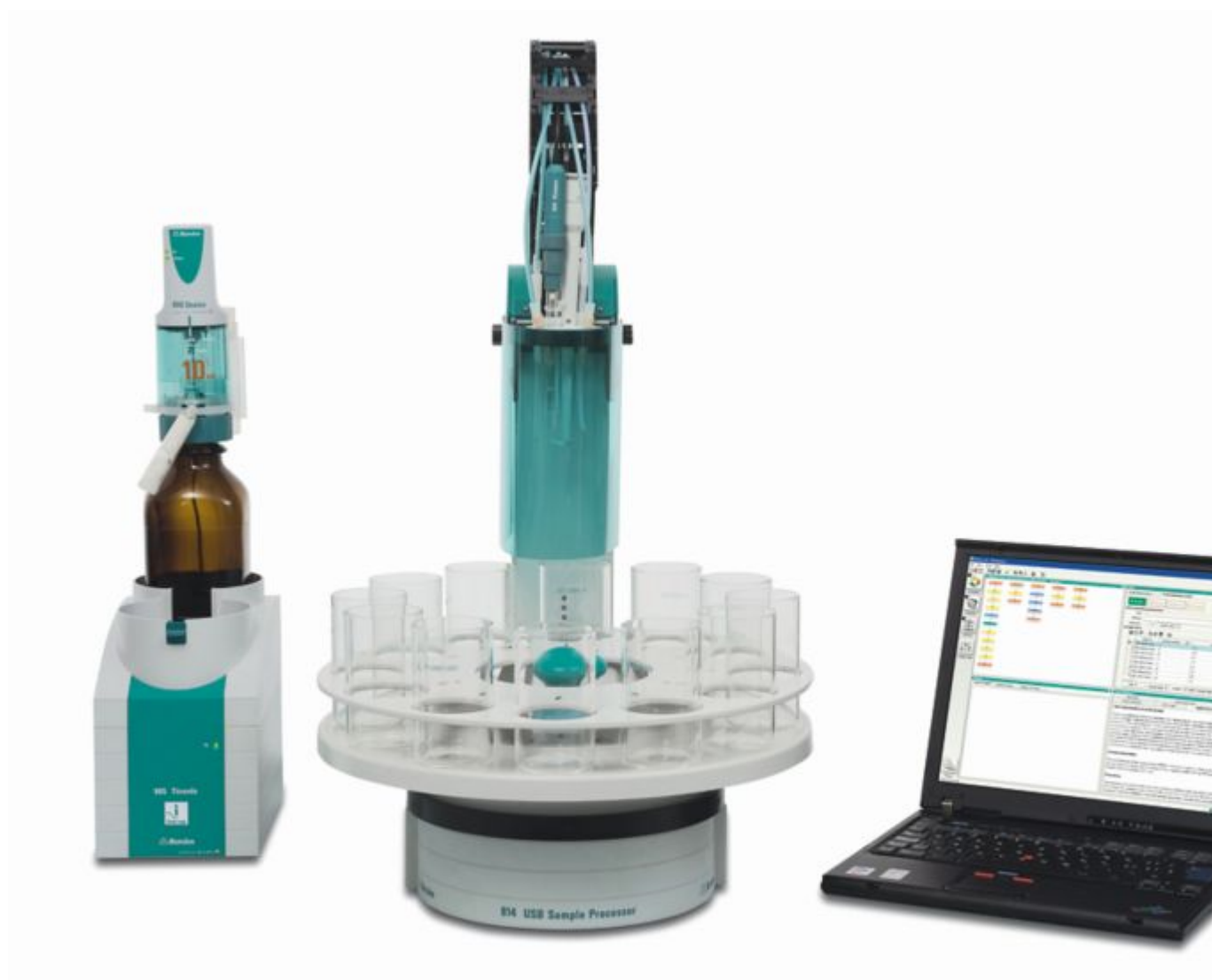
Figure 1. 814 Sample Processor and 905 Titrando equipped with an iAg-Titrode with Ag 2 S coating controlled by tiamo software.

This analysis is carried out on an automated system consisting of an 814 Sample Processor and a 905 Titrando equipped with an iAg-Titrode with Ag 2 S coating.