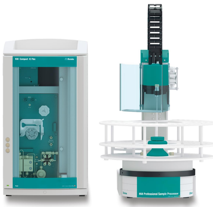
Figure 1. Instrumental setup including a 930 Compact IC Flex Oven/SeS/PP and an 858 Professional Sample Processor.