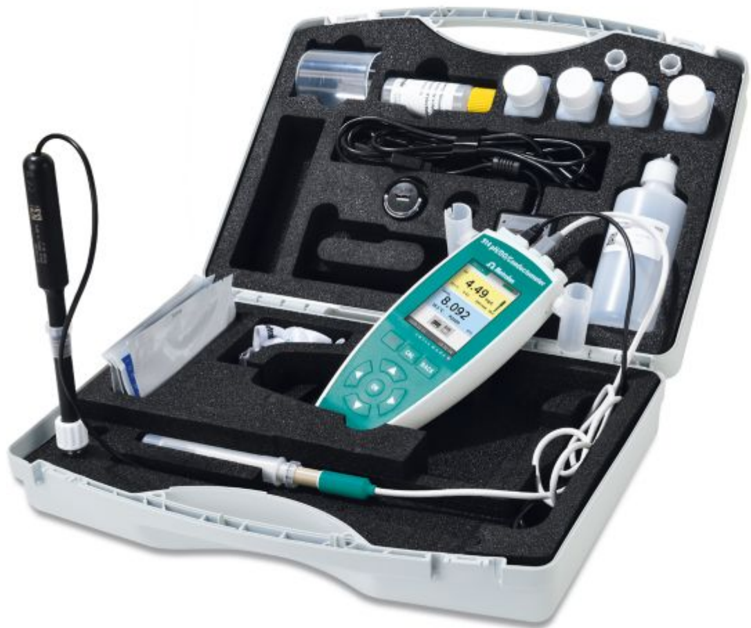
Figure 1. Transport case including all accessories and a 914 pH/DO/Conductometer equipped with an O 2 -Lumitrode and conductivity sensor for the determination of dissolved oxygen in a freshwater stream.

This analysis is carried out on a 914 pH/DO/Conductometer equipped with an O 2 -Lumitrode and a conductivity measuring cell to compensate for the higher salinity. Both sensors are calibrated before the measurement.