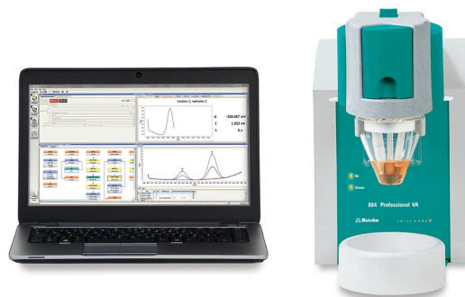
Figure 1. 884 Professional VA.

After diluting the sample in supporting electrolyte, the voltammetric determination of antimony and bismuth is carried out on the 884 Professional VA with the Multi-Mode Electrode pro as working electrode using the parameters listed in Table 1 . The concentration is determined by two additions of antimony and bismuth standard addition solution.