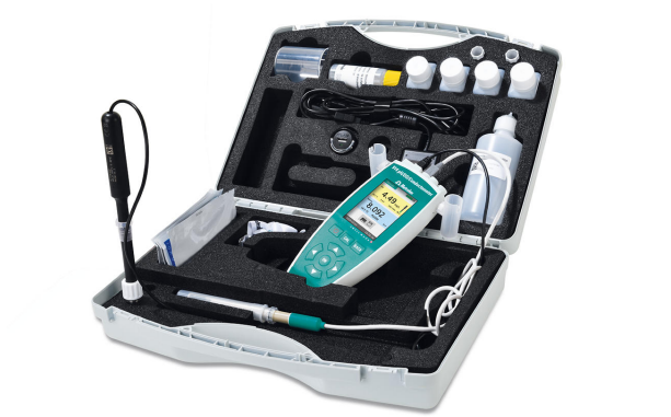
Figure 1. Transport case including all accessories and a 914 pH/DO/Conductometer equipped with an O 2 -Lumitrode and conductivity sensor for the determination of dissolved oxygen in a freshwater stream.

This analysis is carried out on a 914 pH/DO/Conductometer equipped with an O 2 -Lumitrode and a conductivity measuring cell to compensate for the higher salinity. Both sensors are calibrated before the measurement. The sensors are both directly inserted into the surface water at the point of interest, to a depth of at least 3.5 cm.