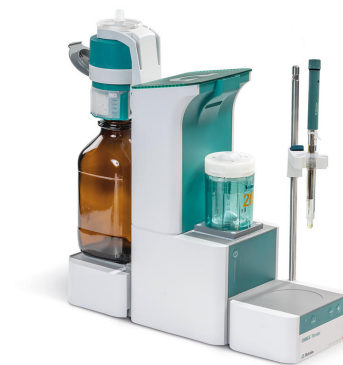
Figure 1. OMNIS Professional Titrator equipped with a dUnitrode with integrated Pt1000.

The samples are homogenized according to their dosage form (e.g., tablets are crushed, gels are shaken, etc.) and dissolved in carbon dioxide-free water.